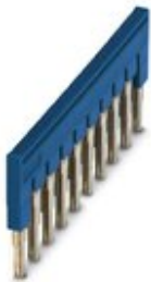
Plug-in bridge, pitch: 6.2 mm, color: blue

Please be informed that the data shown in this PDF Document is generated from our Online Catalog. Please find the complete data in the user's documentation. Our General Terms of Use for Downloads are valid ( http://phoenixcontact.com/download )